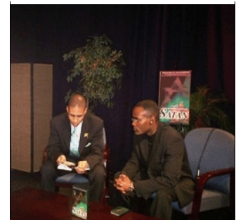
Preparing for One-on-One television interview in Portland Oregon.